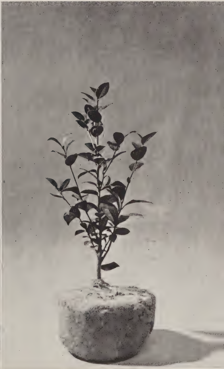
12-18 inch, Branched Camellia B&B